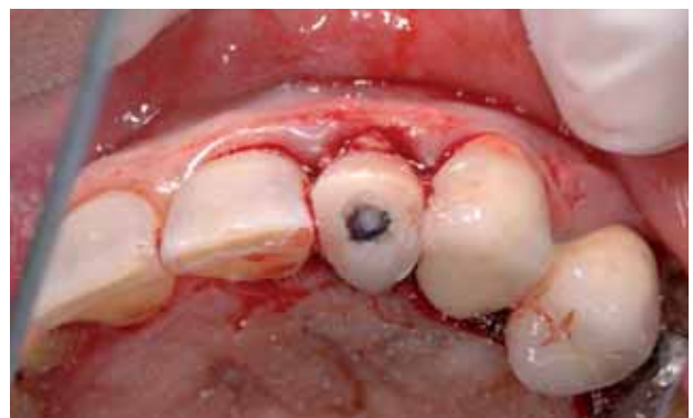
Fig. 3a, 3 b A provisional titanium abutment was used to cement the provisional crown.