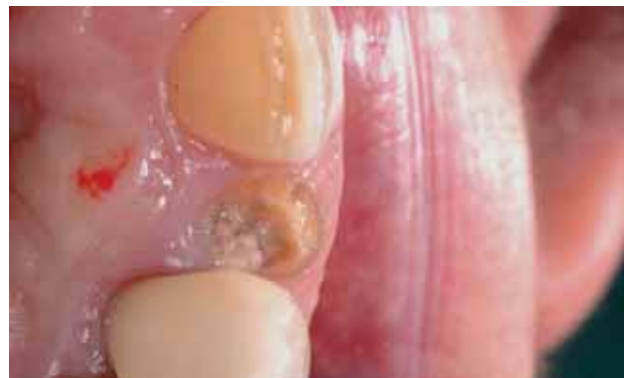
Fig. 1a, 1 b Preoperative clinical examination of the failing left lateral incisor. Frontal and occlusal views.