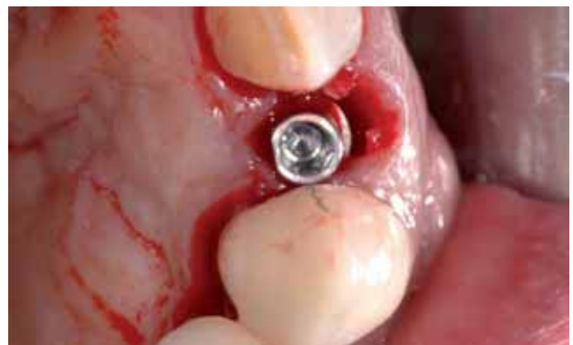
Fig. 2a 2b Tooth extraction and immediate implant placement in the fresh socket.