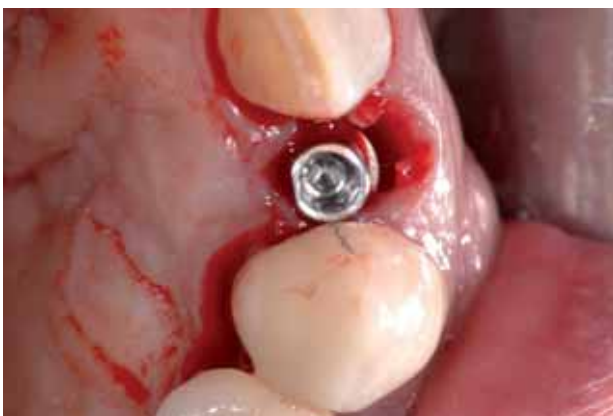
Fig. 4a 4b Radiographic images just after implant placement and 5 months postoperatively.