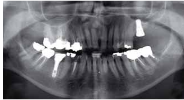
Fig. 2 Post-operative panoramic x-ray after one dental implant was placed in the upper left quadrant taken in October 2008.

relevant, mesial and distal soft tissue discharges were prepared to facilitate visual access to the bone crest. Implants were inserted following the Bone System method (Milan, Italy). After implant placement, the soft tissue was sutured and the implant was left to heal in a submerged way. Sutures were removed 7-10 days post-operatively.