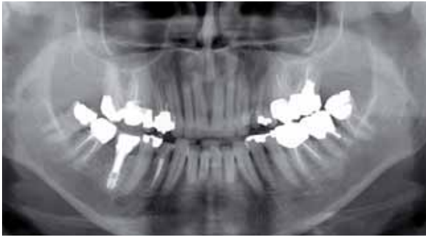
Fig. 1 Pre-operative panoramic x-ray taken in January 2007.