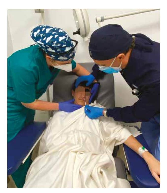
FIG. 5 COVID-19 swab during pre-anesthesia.

will be necessary to use. If the patient cooperates in this sense, he/she can be placed on the dental chair and the anesthetist will insert the needle. If the patient is uncooperating, especially patients with BMP who may be aggressive, it is effective to make an intramuscular injection by distracting him with a hug. This allows the anesthetist to take venous access and to do medical examinations listed above, if it has not been possible. With pre-anesthesia the patient calms down and after a few minutes, venous access is taken. Before administering general anesthetics a sample is taken to not contaminate the blood and to avoid another puncture. At times, it may be useful to take another venous access to a larger vein than that used to administer the anesthetics for sampling.