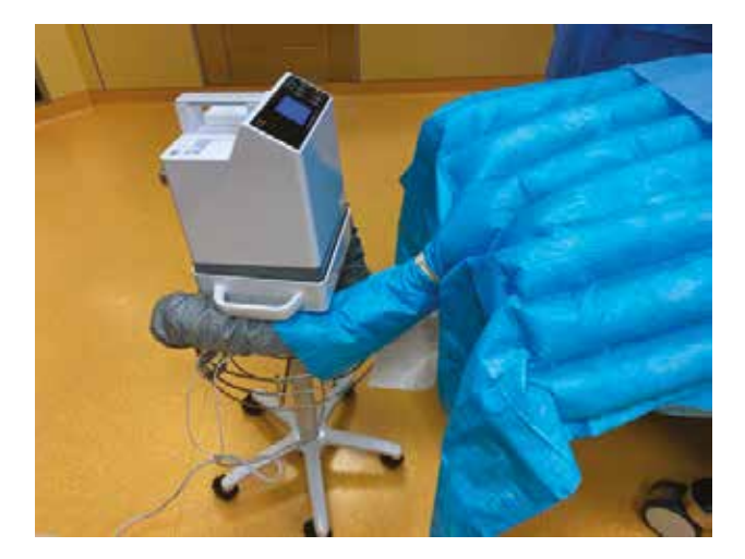
FIG. 6 Air forced warming devices.

surgery can remain under observation from a minimum of 30 minutes to a maximum of a few hours and then return home.