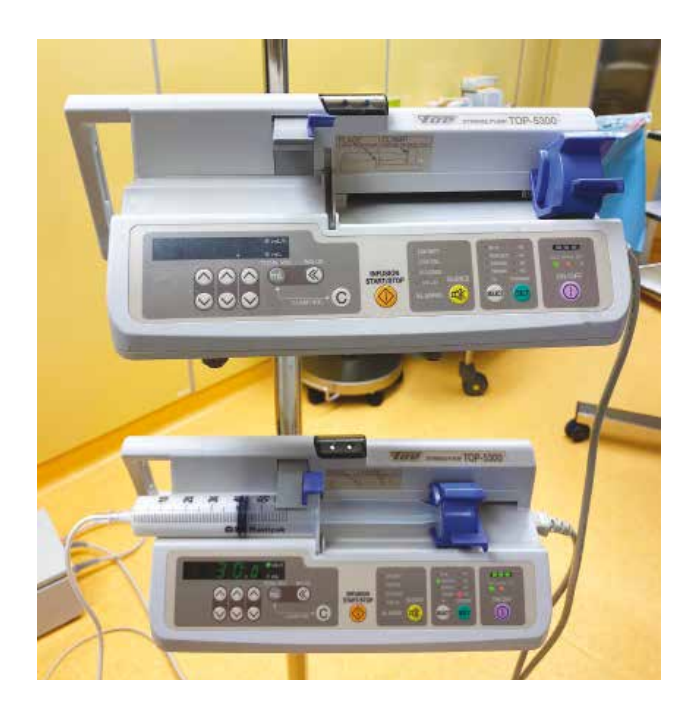
FIG. 3 Programmable syringe pump for anesthesia.