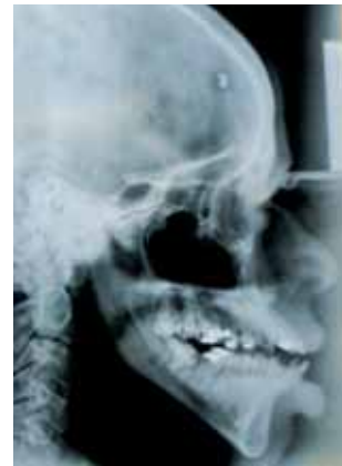
Fig. 3 Pre-treatment teleroadiography.