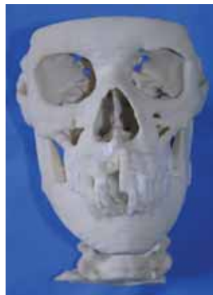
Fig. 6 Stereolithography.

The following surgical interventions were taken into considerations: a partial glossectomy, an advancement of the maxilla at a Le Fort I level and the bilateral mandibular sagittal osteotomies with a midline osteotomy. An enlarged tongue (macroglossia) can cause dentomusculoskeletal deformities, instability of orthodontic and orthognathic surgical treatment, and create masticatory, speech, and airway management problems. Understanding the signs and symptoms of macroglossia will help identifying those patients who could bene-