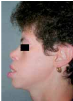
Fig. 1, 2 Patient's frontal and lateral views.