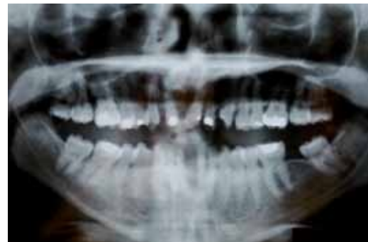
Fig. 4 The severe periodontal disease and the spaces between both upper and lower central incisors. Fig. 5 Pre-treatment orthopantomogram.