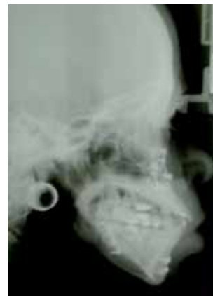
Fig. 7 Final teleroadiograph.