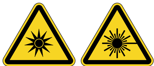
FIG. 2 Warning sign against optical radiation (left) and warning sign against laser radiation (right) (Graphic: C. Prall, smart optics Sensortechnik GmbH).