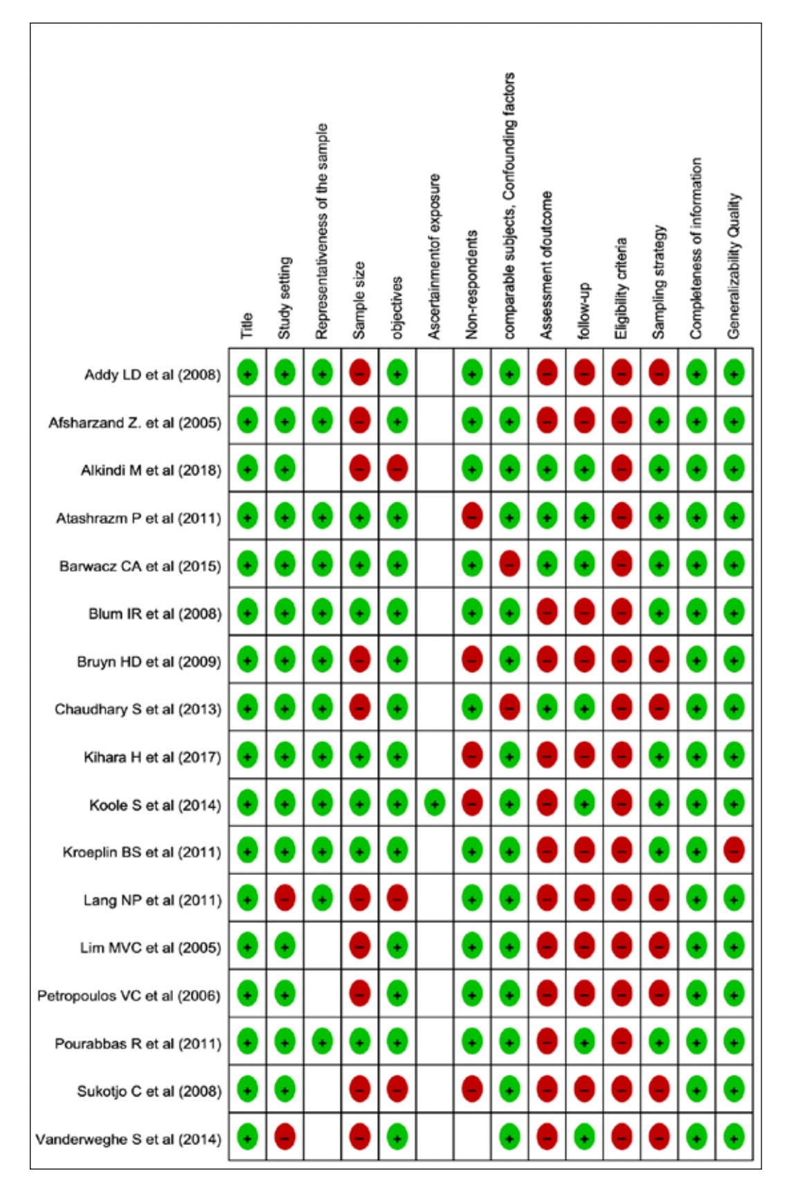
FIG. 3 Risk of bias summary-review authors' judgments about each risk of bias item for each included study. The data extracted from included study were gathered and arranged into tables to evaluate the outcome and characteristics of included studies.

didactic form of training as the leading method of teaching while laboratory and clinical training in certain percentage were included in institutes as summarized in Table 1.