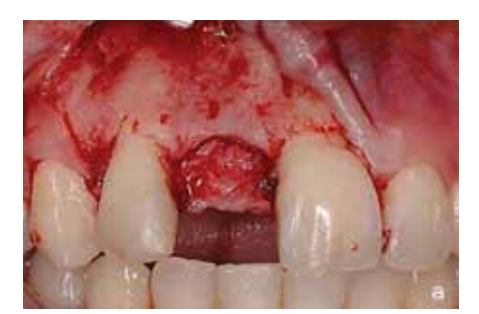
FIG. 3A Mucoperiosteal Incision.