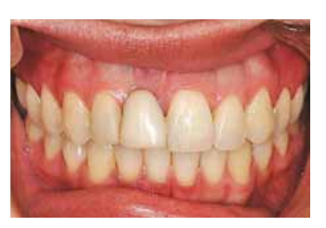
FIG. 1B Bone thickness defect.

A 23-year-old Caucasian girl, showed attendance at the clinic of Oral and Maxillofacial Surgery of the Araçatuba of Dental School – UNESP, in order to replace a partial fixed adhesive denture on teeth 12, 11, and 21 with an osseointegrated implant. There was absence of tooth 11, lost as a consequence of tooth resorption: the patient had suffered a tooth avulsion at the age of 10 years. On the day of the avulsion the tooth was reimplanted by a dental surgeon specialized in Pediatric Dentistry, in the city where the patient