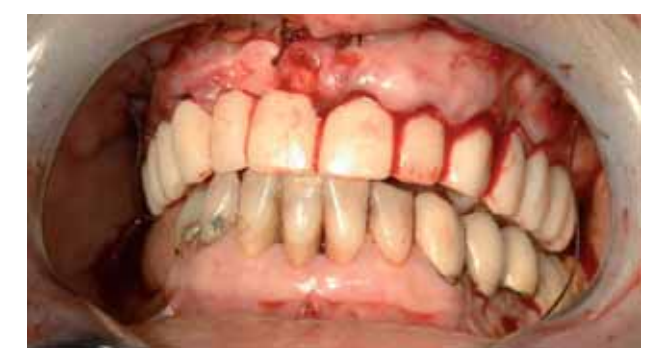
Fig. 13 The occlusion at the end of the operation.