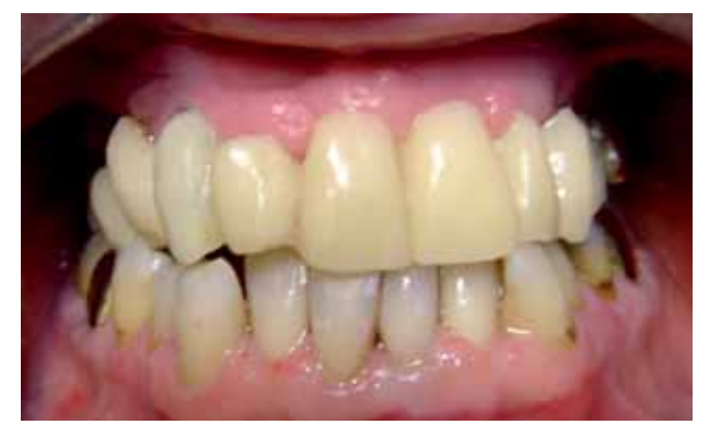
Fig. 14 Frontal endoral view after 8 months.