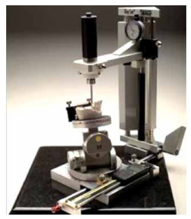
Fig. 5 The three-dimensional parallelometer for the transfer of implant position from the virtual project to the master model.