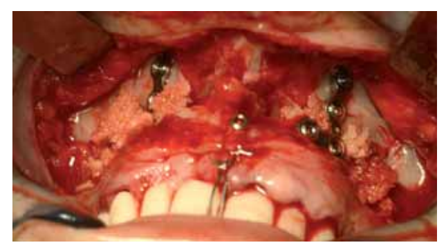
Fig. 12 Internal rigid fixation and bone grafts.