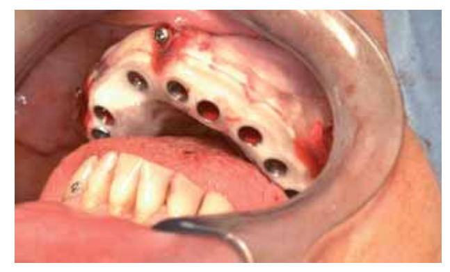
Fig. 6 The surgical guide used during the operation.