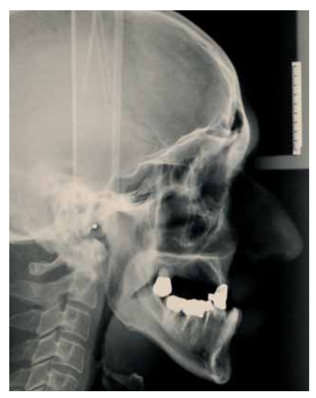
Fig. 3 Pre-surgical teleradiograph.