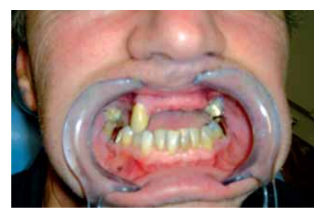
Fig. 1 Frontal pre-surgical endoral photo.

Recently, a system to combine computerplanned data to a working cast has been reported (19). The procedure allows the