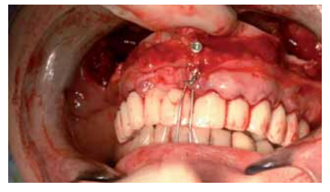
Fig. 10 Temporary intermaxillary fixation to maintain the occlusion during the upper jaw fixation.

position obtained by CT and elaborated with a computer program (Implant 3D Software Media - Lab co. La Spezia, Italy). Thanks to the values in the radiographic template, the data elaboration program allows the definition of the implants position with respect to the anatomical paraxial planes prosthetically involved. The faithful reproduction of each implant position on the master model, by means of the implant analog insertion and the treatment simulation, represents the goal of the prosthetic rehabilitation plan and creates the assumption for the temporary and immediate prosthetic construction. Moreover the construction of surgical template of highest precision is done on the basis of the same virtual data. Ray-Set apparatus (Biaggini Medical Devices, La Spezia, Italy) has been planned for the data transfer from the virtual one to the real three-dimensional one. It is а parallelometer able to define the axes relative to the implants positions, their inclinations on the bi-dimensional plans (linguo-vestibular and mesio-distal) and the vertical heights.