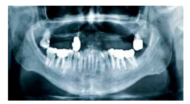
Fig. 2 Pre-surgical ortopantomograph.