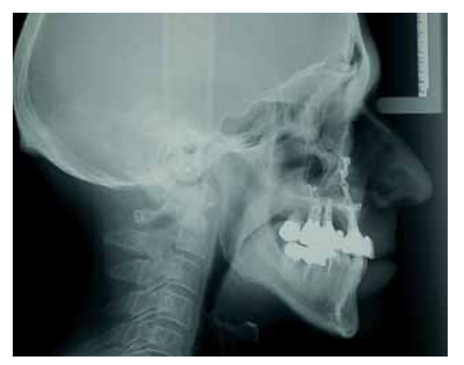
Fig. 16 Post-surgical teleradiography.

implant patients (20). Recently, computer software programs and 3D radiographic techniques have become available to allow clinicians to manipulate digital images on PC computer software programs and to provide the practitioner with precise implant placement planning (17, 20). However, the exact positioning of the implant with respect to location and angulation is often difficult 25 and to reduce alignment problems, numerous types of radiological, surgical and combined templates and techniques have been proposed (21-27). Therefore, the precise positioning of implants is an essential goal and it may be improved by guidance during the drilling process. Image quidance can reduce the inherent