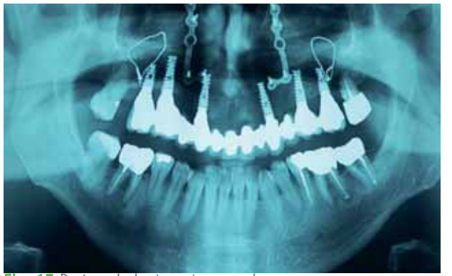
Fig. 15 Post-surgical ortopantomography.