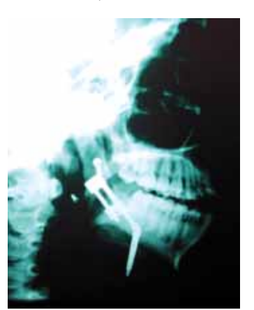
Fig. 8 Teleradiography performed at the end of the distraction period.