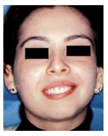
Fig. 6 Front view of the patient at the first visit.

The patient gained a symmetrical aspect that was stabilized with a 8 months orthodontic treatment (Fig. 10, 11).