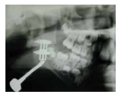
Fig. 3 Postsurgical orthopantomograph showing the distraction device screwed across the osteotomic line.