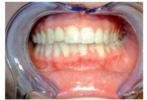
Fig. 11 The occlusion at the end of the treatment: see the correct position of the occlusal plane.