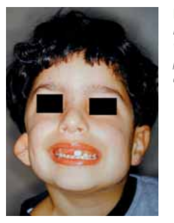
Fig. 1 Frontal view of the patient at admission.

The patient underwent DO by means of intraoral access. Under general anesthesia, an incision was made in the lateromarginal mucosa of the right mandibular angle. Subperiosteal detachment was performed with exposure of the gonial angle and of the area adjacent to the ascending portion of the right branch. Osteotomy of the mandibular branch was carried out above the last molar. The osteomized bone segments were mobilized and a 15 mm intraoral bone distractor was positioned. It was activated once a day with a 0.75 mm distraction for 9 days. Then the distraction device was maintained in place for 3 months in order to stabilize the area (Fig. 3, 4). Finally it was removed. The patient gained a symmetrical aspect (Fig. 5). In October 2007 an Herbst device was used for 7 months to stimulate mandibular bilateral growth.