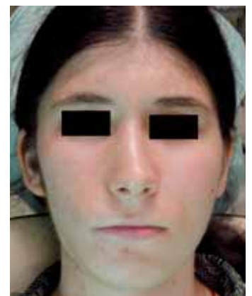
Fig. 15 Front view of the patient at the end of the follow-up period.