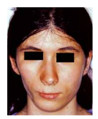
Fig. 12 Front view of the patient at admission.

Today, the DO, first described for orthopedic surgery by Ilizarov in the 60's, has minimized the need for