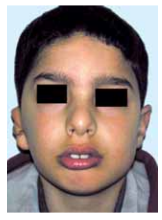
Fig. 5 Front view of the patient at the end of the follow-up (the right ear is not reconstructed yet).

Fig. 2 Down-up view of a CT 3-dimensional reconstruction highlighting the asymmetry of the mandibular arch.