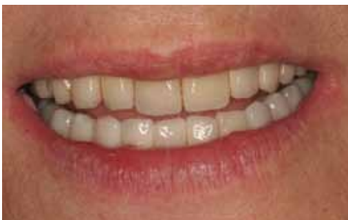
FIG. 2F One year postoperative appearance extraorally.