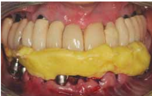
FIG. 2D Initial occlusal registration procedures were immediately performed on the impression copings by using polyether registration material.