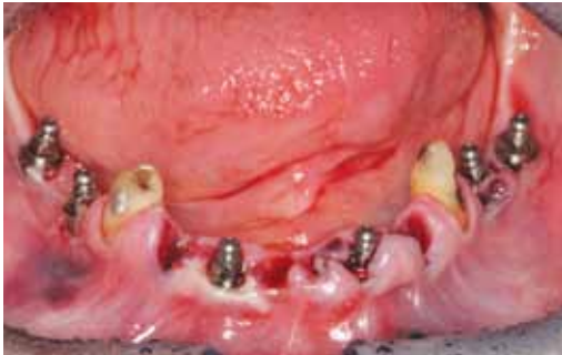
FIG. 2B Immediate intrasocket implant placement providing adequate soft tissue support and preservation.