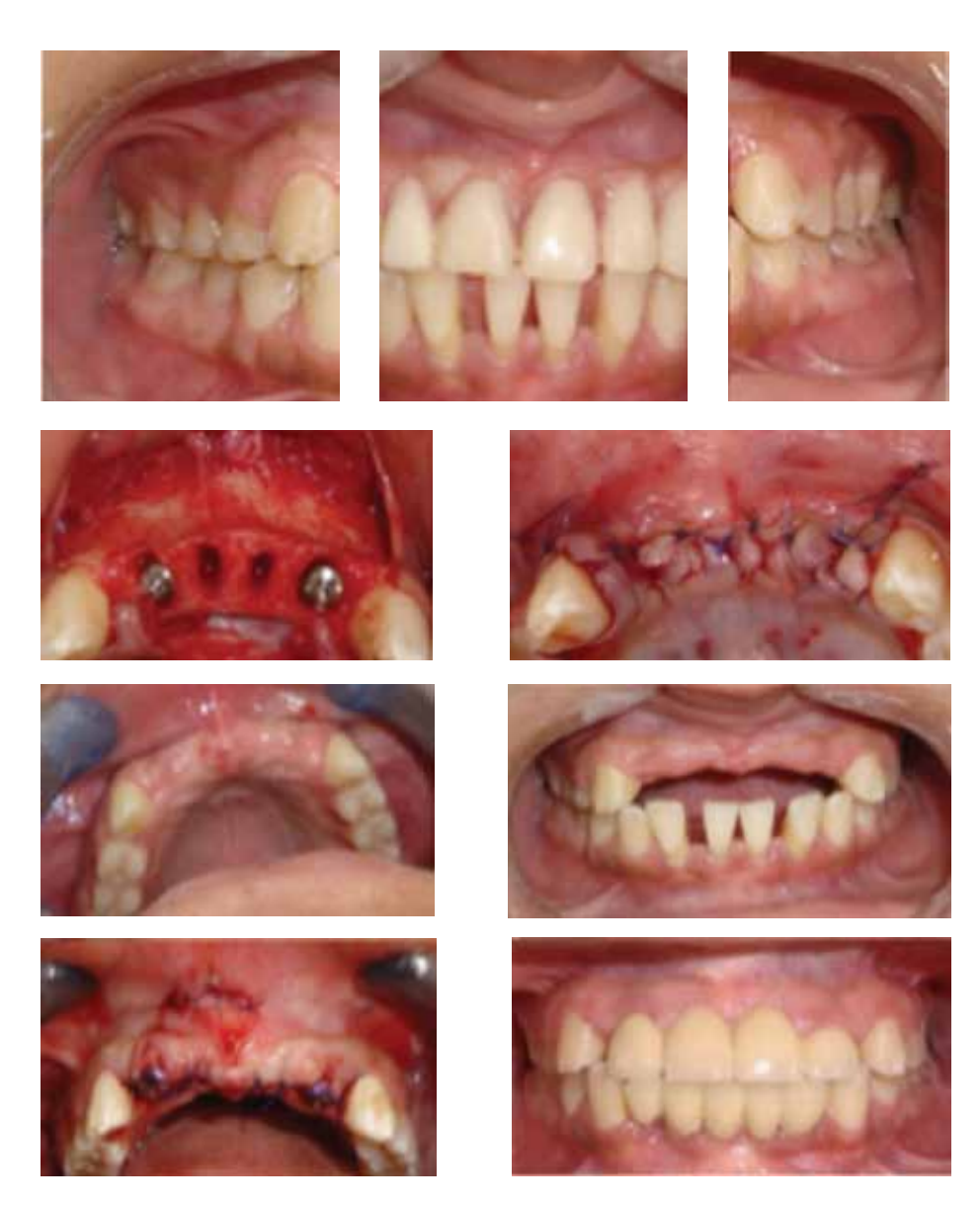
FIG. 1 Implant-supported rehabilitation procedure in patients with localized aggressive periodontitis.

Mobility (50%) was the main cause behind the need for teeth replacement in the test group. While dental