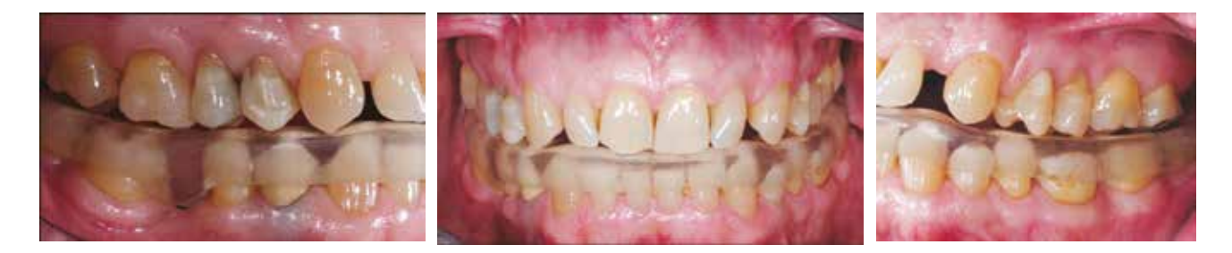
FIG. 6 Intraoral pictures of the splint immediately after delivery.

The authors presented a technique to manufacture