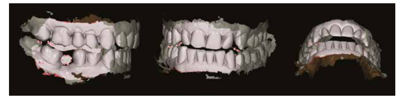
FIG.2 Intraoral scan with dental arches at the correct vertical relationship as obtained with Dawson's manipulation.

The intraoral scans of the maxillary and the mandibular arches presented enough points in common with the bite registration to have the maxillary and mandibular arches "digitally mounted" with the same intermaxillary relation of the wax index recorded with Dawson's centric relation technique (Fig. 2).