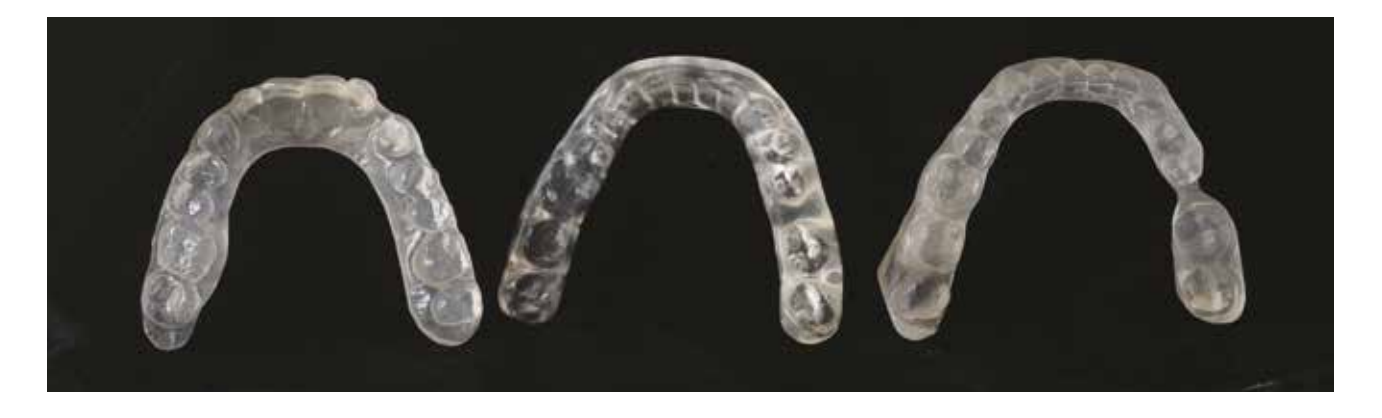
FIG. 5 Splint produced with a multi-jet 3D printer and verified on the prototyped casts.