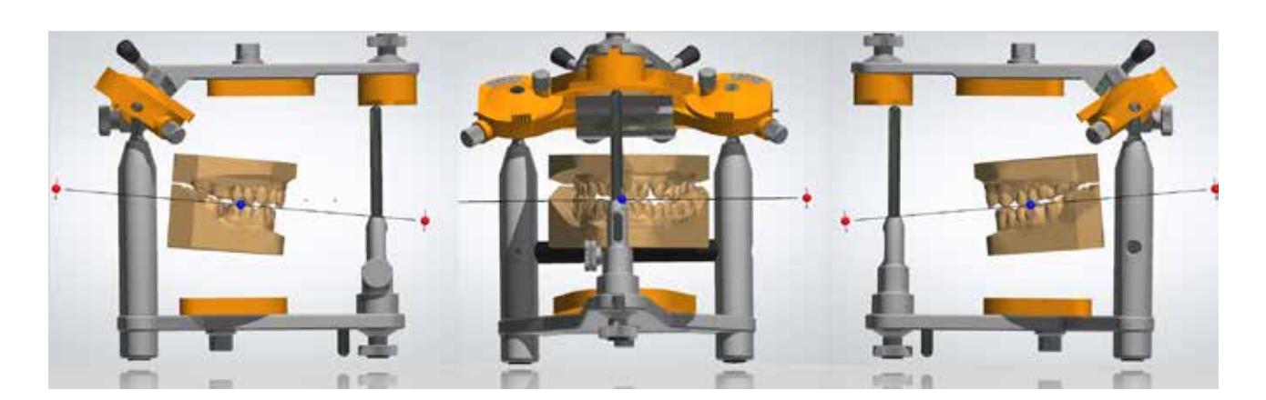
FIG.3 Digital casts in the correct vertical relationship for splint design and manufacturing.