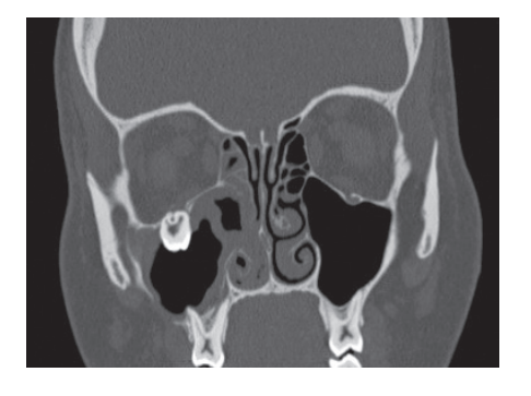
FIG. 1 Coronal CT scan: ectopic molar of the right orbital floor implanted at the level of the infraorbital nerve canal.

Third molars are often impacted or in an ectopic position, and usually associated with dentigerous cysts, which are most frequently found in the age group 20 to 40 years, rarely seen in childhood and with a frequency that decreases with age. About 70% of dentigerous cysts occur in the mandible, and 30% in the maxilla. Dentigerous cysts associated with ectopic teeth within the maxillary sinus are fairly rare: in the literature about 30 cases have been described (8), but only few cases involving the floor of the orbit (9–12). Most patients (90%) had a single dentigerous cyst in