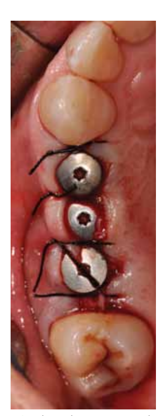
FIG. 5 The implants were inserted and the flap was sutured.