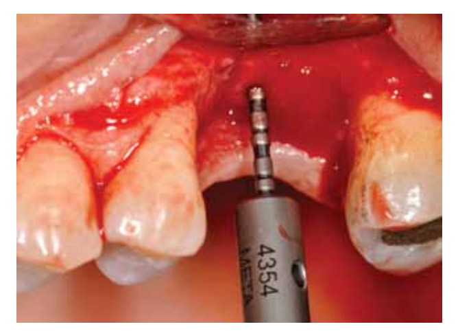
FIG. 11 Sin Probe was used to ensure the correct working depth.