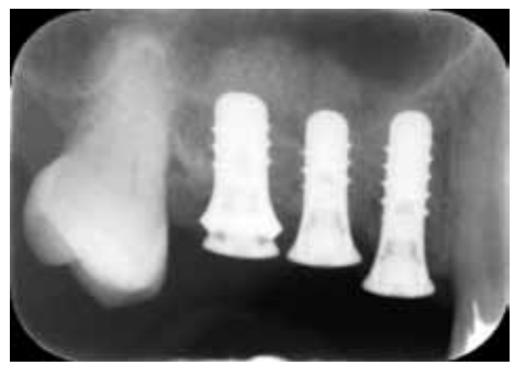
FIG. 6 Intraoral postoperative X-ray showed the correct execution of sinus lift procedure and the implant placement.