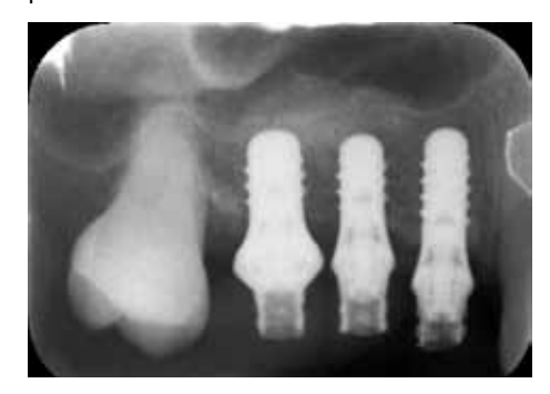
FIG. 7 X-ray 8 months after surgery showed a satisfying bone augmentation.

residual bone height) guarantees the correct depth of the site. In the protocol the subsequent drill is the Guide Drill (diameter 3 mm and working length only for the last 2 mm). Finally the SinCrest<sup>®</sup> Drill was used to make a 3-mm hole.