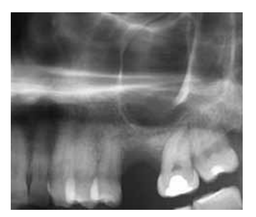
FIG. 8 The X-ray of 2.6 site showed inadequate bone volume for implant placement.

It was decided to perform a sinus lift with crestal approach using SinCrest<sup>®</sup> device with the simultaneous placement of an implant in area 2.6 (Fig. 9-14). After 6 months the X-ray showed a final crestal bone height of 7 mm.