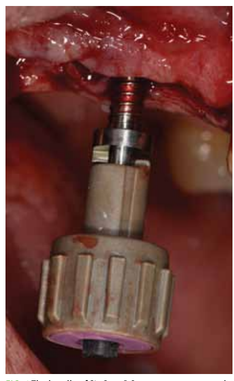
FIG. 4 The handle of SinCrest® Osteotome was rotated by half a turn firstly counterclockwise and then clockwise, applying a slight axial pressure.